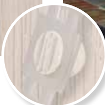
Close up of pre-aligned grain plug