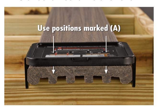
Install screws in positions marked A to ensure proper placement centered in the scalloped profile for standard installation