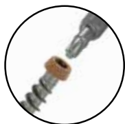
TORX® ttap® drive system

The TrapEase Color Matched Deck Screw creates a beautiful color matched finish in leading deck board brands including: Fiberon®, TimberTech®, Trex®, Deckorators®, and more!