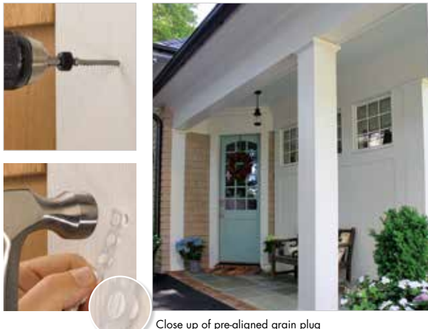
Close up of pre-aligned grain plug